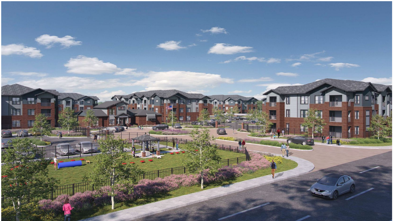
The Palladium Simpson Stuart apartments will have 270 units. (Palladium USA )

The project near Interstate 20 is the latest for builder Palladium USA.