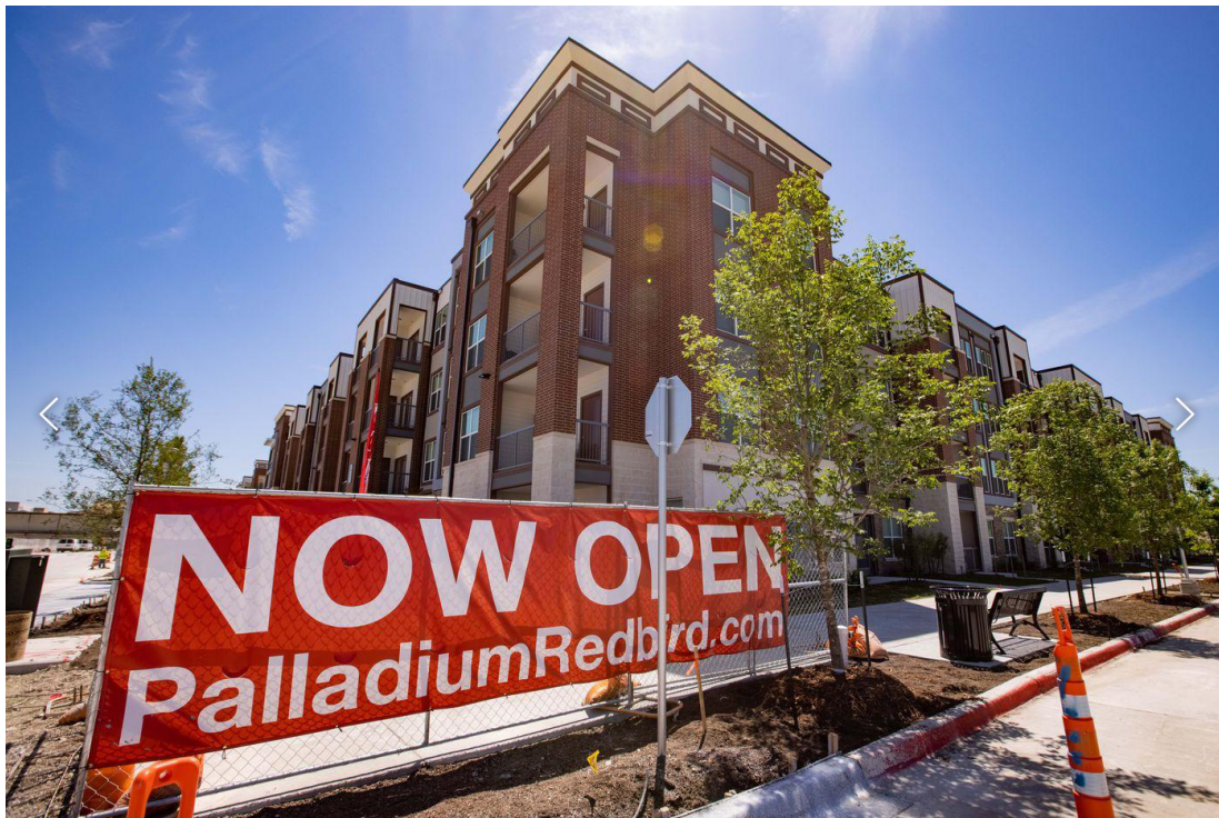
1/6 The exterior of the Palladium RedBird apartments.

"We — the city of Dallas — put $28 million into the project," he said. "If you know the history of this mall and this neighborhood, this was an upscale neighborhood, and now it is coming back."