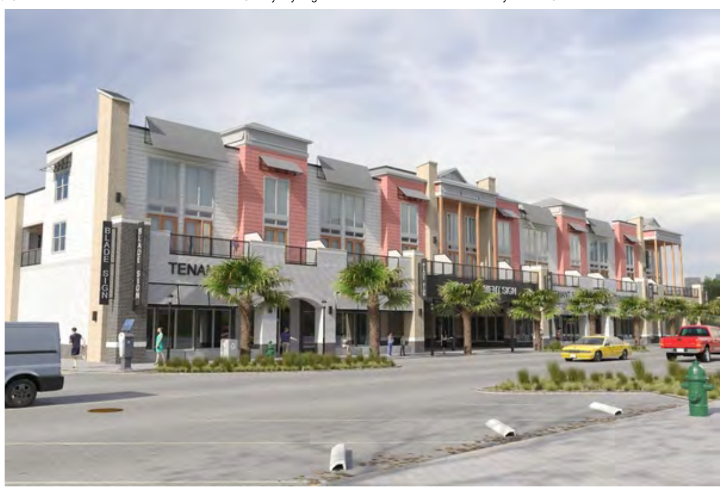
The first residents are expected to move into the development by 2022