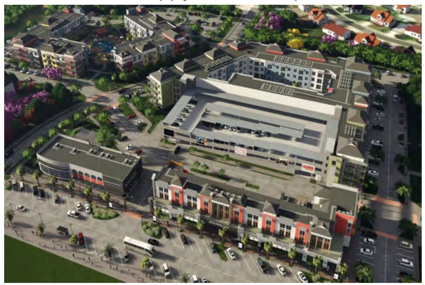
Little Elm integrates 324 rental properties and retail and commercial space

Smart affordable housing provider Planet Smart City is partnering with international real estate developer Palladium Group to build a tech-enabled rental housing complex in Little Elm, Texas.