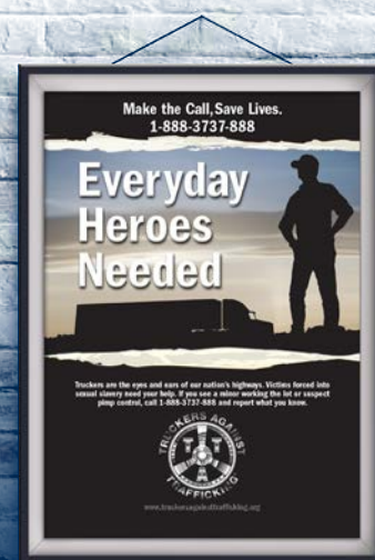
TAT Awareness Poster

“ HUMAN TRAFFICKING HAS SURPASSED ARMS TRAFFICKING AND IS SECOND ONLY TO DRUG TRAFFICKING. ”