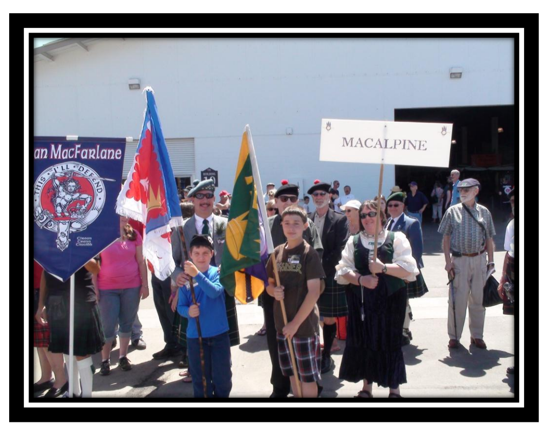
McAlpine Clan March