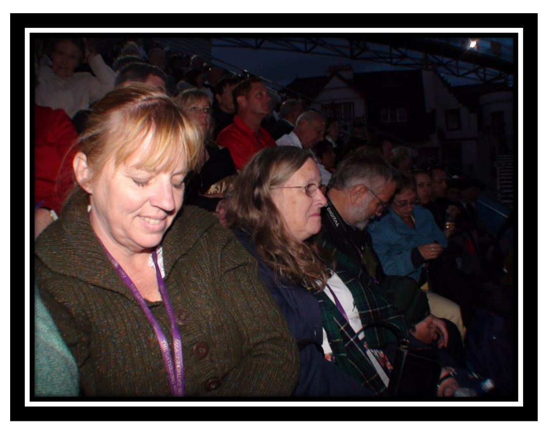
Scottish Play at the Edinburgh Castle Esplanade