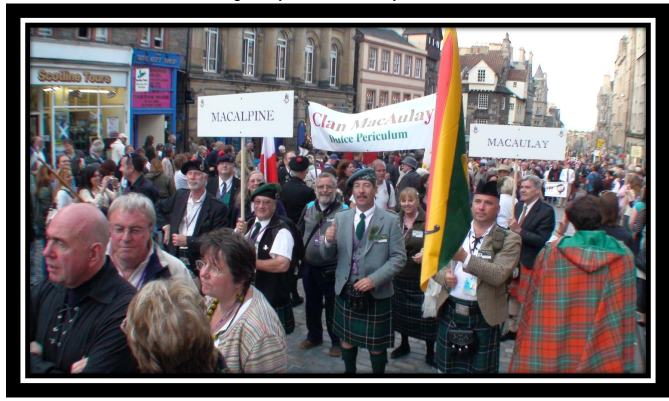
Pageant Clan March of the Royal Mile, a welcome home