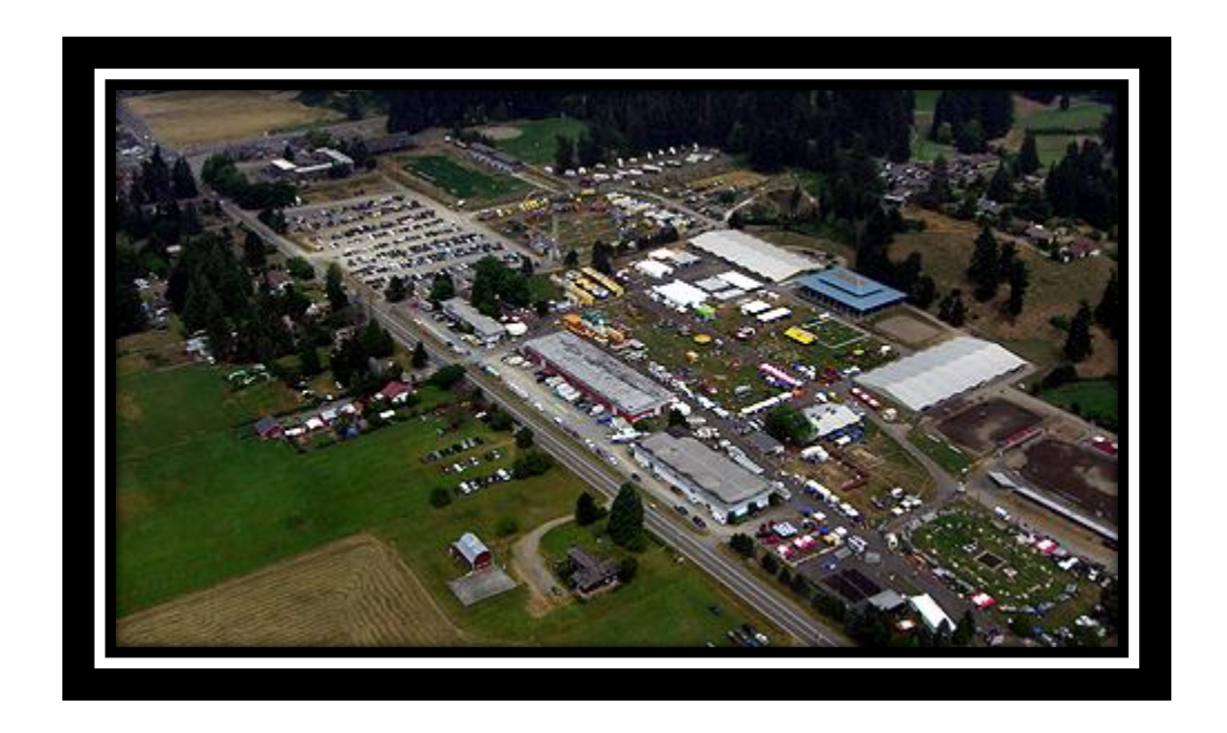
Aerial view of the Enumclaw Expo Center, site of the 62nd Annual Pacific NW Highland Games.