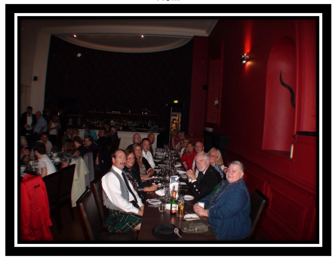
Clan McAlpine Dinner