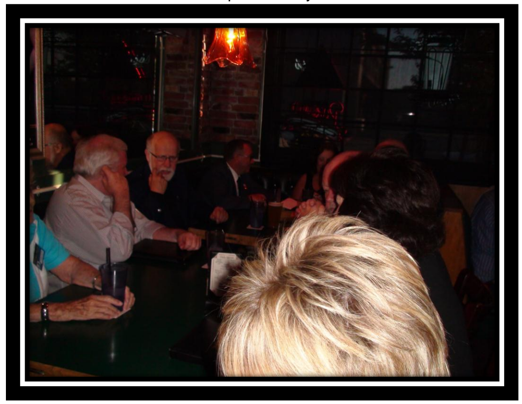
Clan McAlpine Dinner