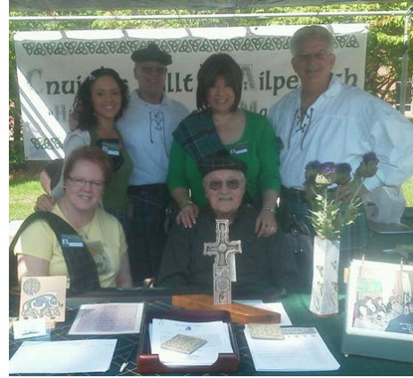
The Society Tent at the Alma Michigan Games.