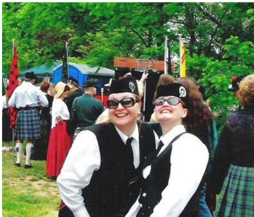
More fun at Grandfather Mountain