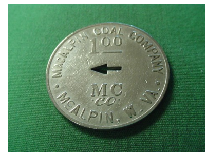
The miners used scrip to make purchases at the company store. The scrip was in the form of small metal tokens rounded like coins, stamped in various denominations.

Coal Mining is inherently dangerous, with cave-ins, explosions, asphyxiations and fires particularly hazardous. Tragedies touched most families involved in mining. The danger continues today.