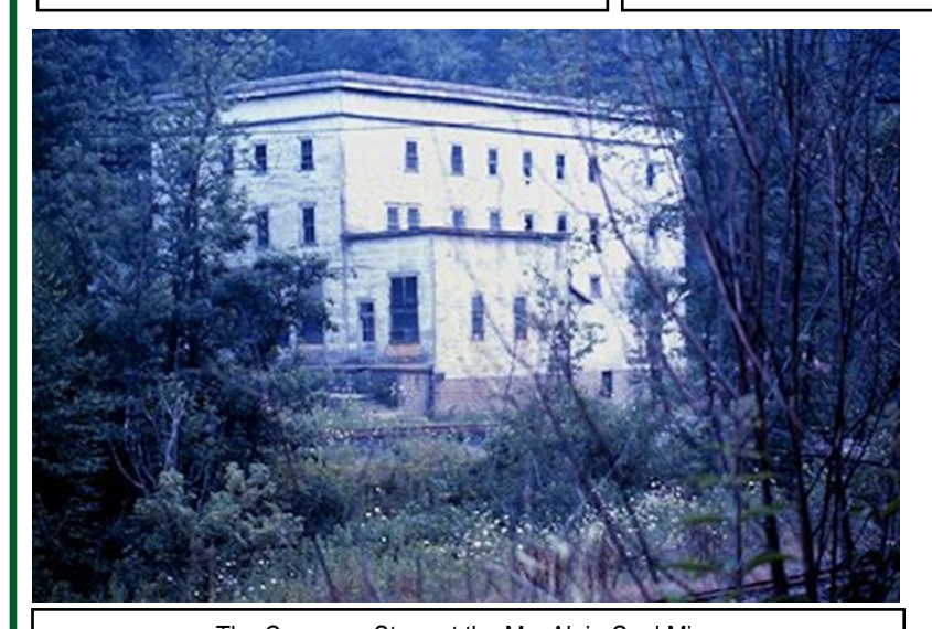
The Company Store at the MacAlpin Coal Mine

lease employing 248 workers. Haulage was by electric motor and mules, and mining done by pick and machine.