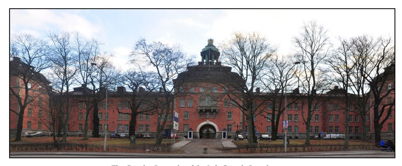
The Cavalry Barracks of the Life Guards Battalion

The Burns Dinner was held in the beautiful Officer's Mess of the Life Guards Battalion.