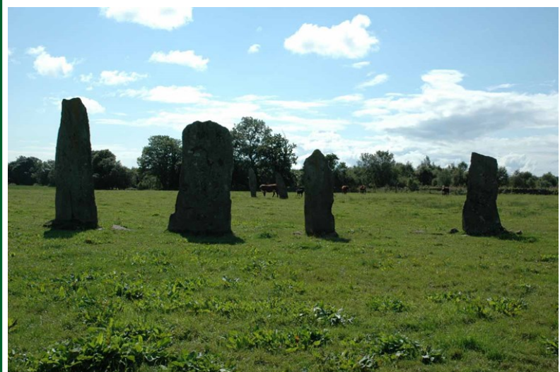
The Ballymeanoch Stones

Ballymeanoch, about 1.5 miles south of Kilmartin on the A816, is probably best known for the impressive standing stones which have stood for over 4000 years. They are thought to be connected with the mid-winter solstice but there is a much darker tale connected with Ballymeanoch.