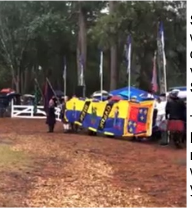
Sunday the weather turned, and we were blessed with a beautiful Georgia

day. With sunny skies, the attendance on Sunday was spectacular. The clan tents, vendor areas, and food concessions were all full of people enjoying all that is Scottish! (I happened to have Eggs and Haggis for breakfast...and it was fantastic!).