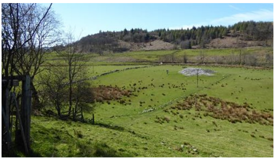
The Glebe behind the Kilmartin Church

Like the gentry in other countries, the Heritors ruled the countryside. They were responsible for justice, and law and order in their district and for keeping the roads in good repair.