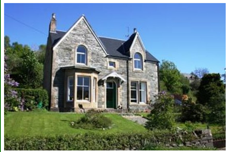
(the newer Kilmartin Manse, currently a bed and breakfast. The original Manse is now part of the Kilmartin Museum)

A Heritor was a privileged person in a parish in Scots law, often a relative of the Clan Chief, and sometimes a Chieftain. The Heritor was bound by title deed for the payment of certain public burdens.