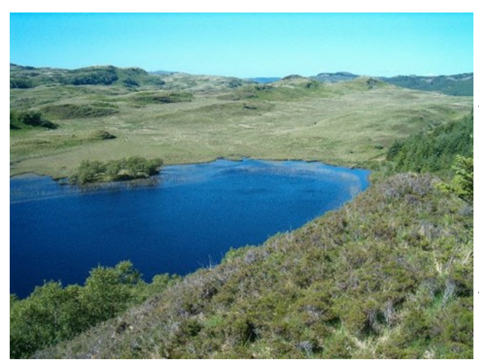
Lochan-na-Corra where the five boys drowned 3 miles south east of Kilmartin Church

brakes. On reaching the green in front of the Kilmartin Hotel the coffins were again placed on the shoulders of the relatives of the deceased, and, marching in single file, were carried to their last resting place in one large grave in the lower portion of the Churchyard. When all the coffins had been lowered and placed side-by-side, with about six inches between, Rev. J. Dewar again engaged in prayer, and before all the mourners dispersed the largest grave in Kilmartin Burying- Ground was closed.