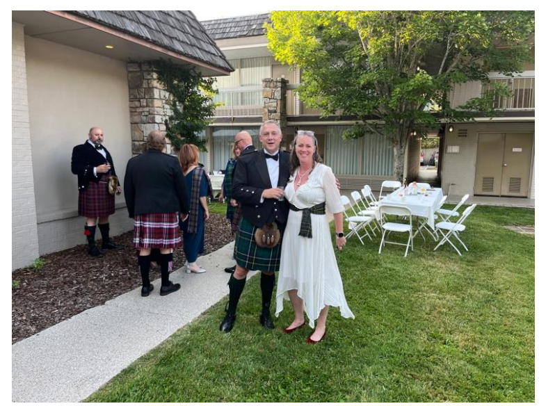
There is also a gala dinner with pipers and haggis held at the host hotel.