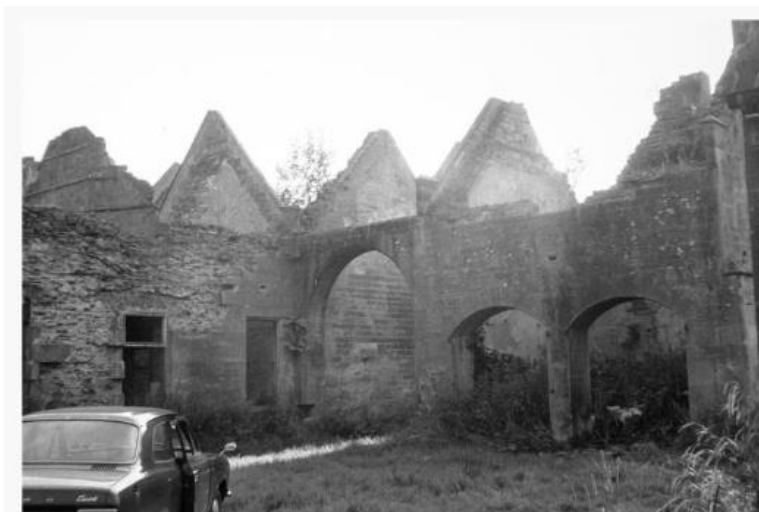
Poltalloch House, General view of house in gutted state