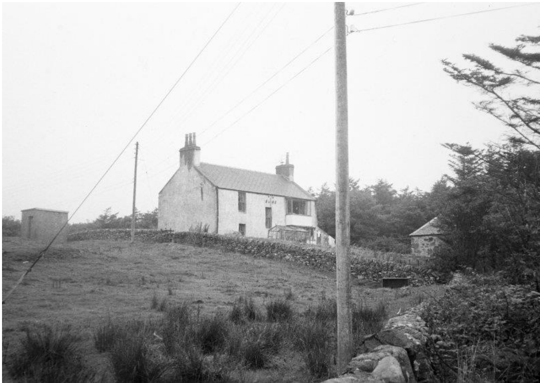
The Bleak House at Laphroaig, Islay