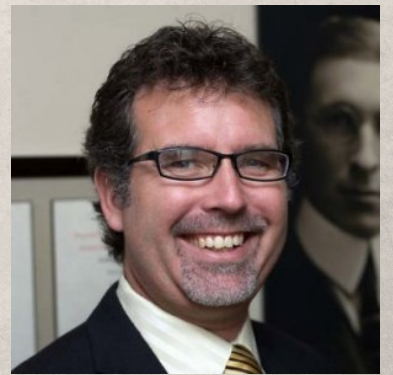
Grant Maltman Banting House