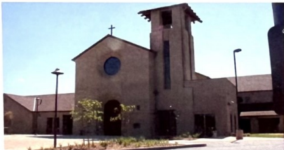
St. Frances X. Cabrini Church 12687 California Street Yucaipa, CA 92399