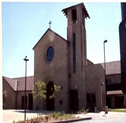
St. Frances X. Cabrini Church 12687 California Street Yucaipa, CA 92399