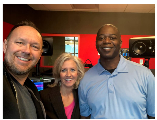
Figure 1 Radio Show - In The Community