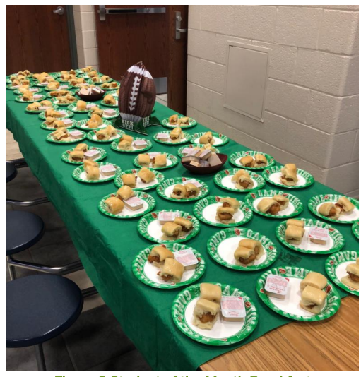
Figure 2 Student of the Month Breakfast