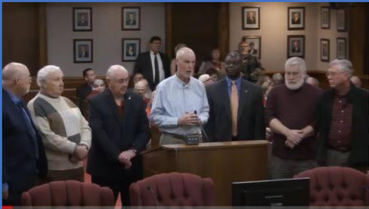
Spotsylvania Board of Supervisors 11 15 18