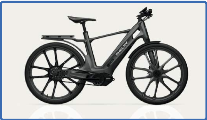
GUNMETAL GREY WITH BLACK STRIPES