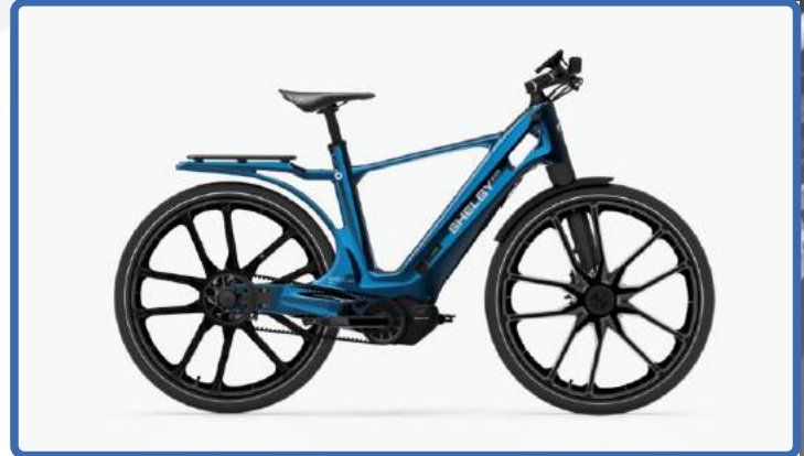
GAURDSMAN BLUE WITH WHITE STRIPES