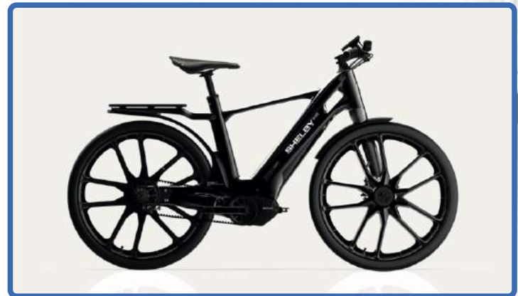
SHADOW BLACK WITH GREY STRIPES