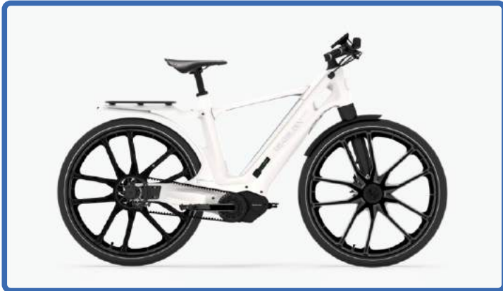
WIMBLEDON WHITE WITH BLUE STRIPES