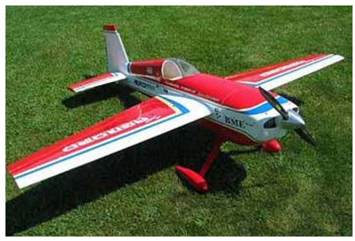
Hugh Ellis' Edge 540