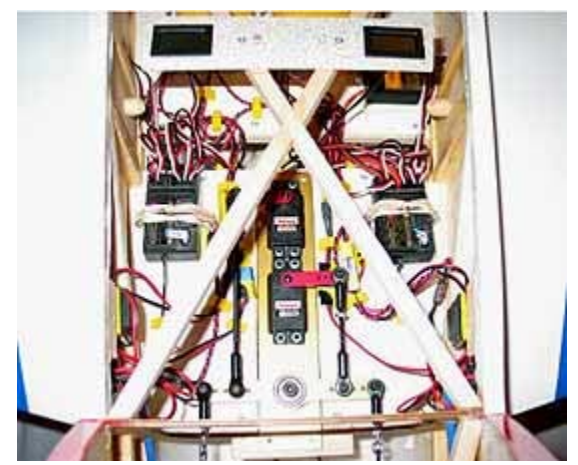
Interior of Edge 540