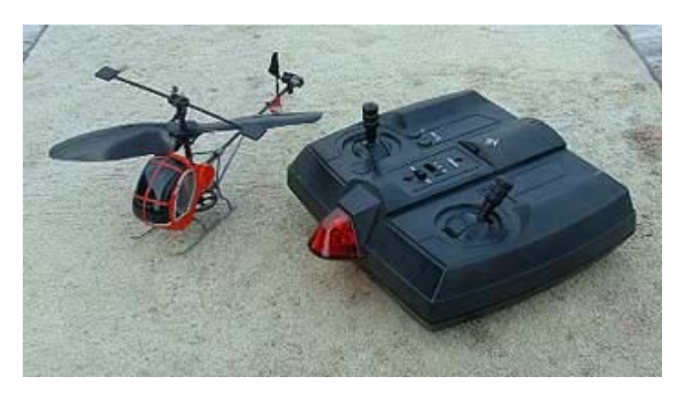
Gene Clark's Micro-Copter

Sean Popp was flying his Pilatus Porter. This is a strange looking plane, but Sean's plane was true to its scale. It's a lot larger than it appears. It has an 8 foot wing and flies with an MVVS-26.