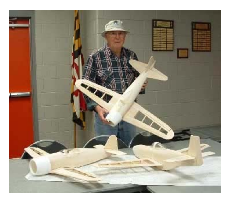
March 2005. The Jim Snyder Airplanes With an Attitude Mfg. Co.