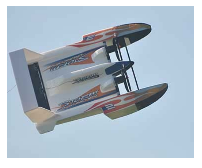
Holy smokes....a flying boat at our field?

Most people know Airtronics from their radios. But 20 years ago, Airtronics was into airplanes too. In 1990 they had a new 113" sailplane called the Legend. This had parts made of Kevlar for strength. It was a contest level planes with all sort of innovations.