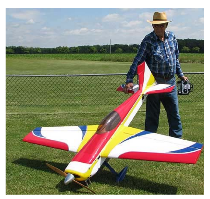
Dan Bowman and the Extra 260