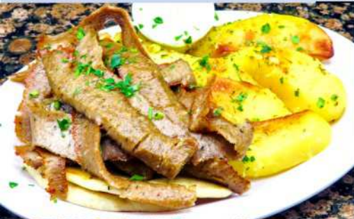
Gyro Plate Sliced beef & lamb mix over pita bread $25.95