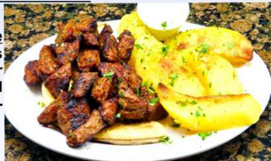
Souvlaki Plate Chargrilled chunks of marinated pork over pita bread $25.95 -