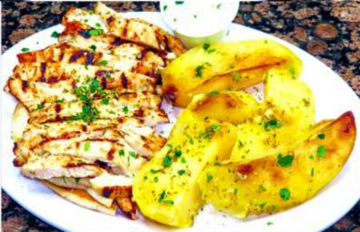
Grilled Chicken Breast Chargrilled marinated chicken breast over pita bread $25.95