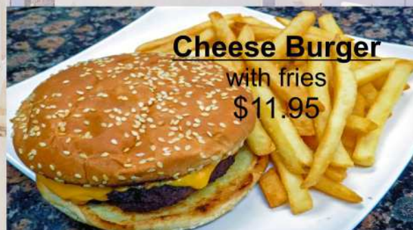
Cheese Burger with fries $11.95