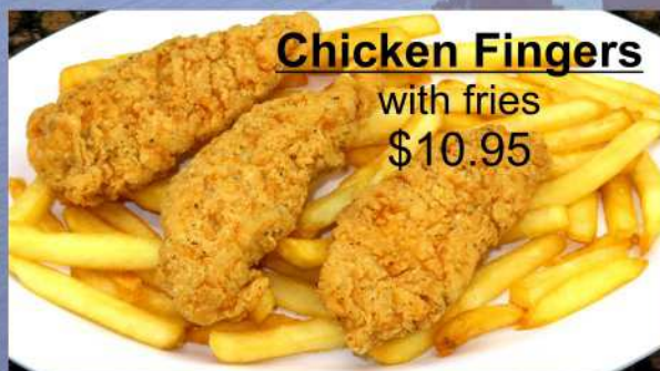
Chicken Fingers with fries $10.95