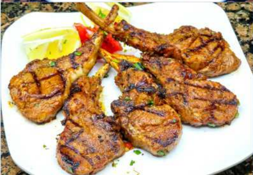
Lamb Chops Five chargrilled baby lamb chops $37.95