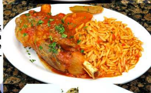
Lamb Shank Cooked with Mediterranean sauce $30.95 -