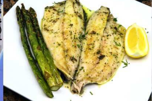
Fresh Baked Branzino Tender Fillet Mediterranean Sea Bass imported from Greek islands (upon availability) $34.95 -