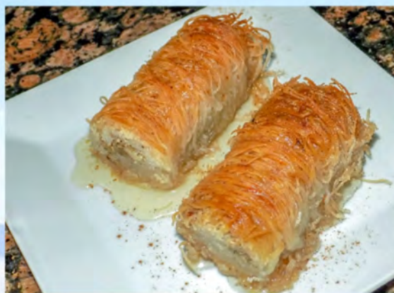
Kataifi Two pieces of shredded phyllo, with nuts & honey $5.50