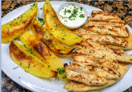
Grilled Chicken Breast Chargrilled marinated chicken breast over pita bread $17.95