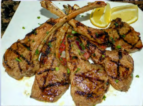
Lamb Chops Five chargrilled baby lamb chops $29.95