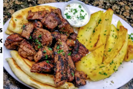
Souvlaki Plate Chargrilled chunks of marinated pork over pita bread $17.95