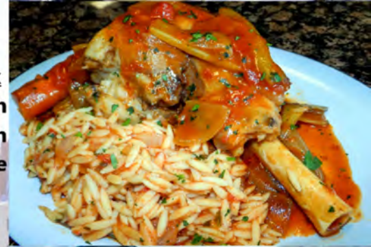
Lamb Shank Cooked with Mediterranean sauce $20.95