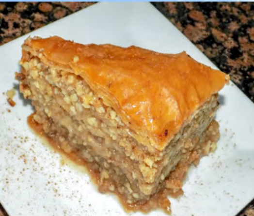
Baklava Nuts & honey baked in phyllo dough $5.50