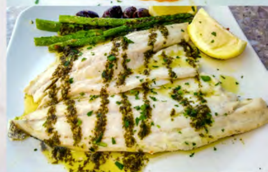
Fresh Baked Branzino Tender fillet Mediterranean Sea Bass imported from Greek islands (upon availability) $23.95