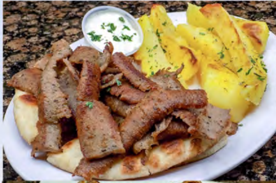
Gyro Plate Sliced beef & lamb mix over pita bread $17.95