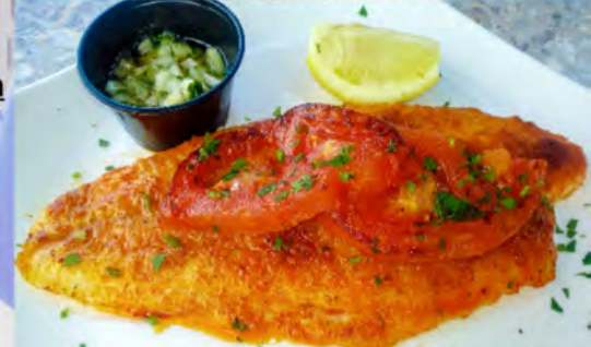
Baked White Fish $17.95