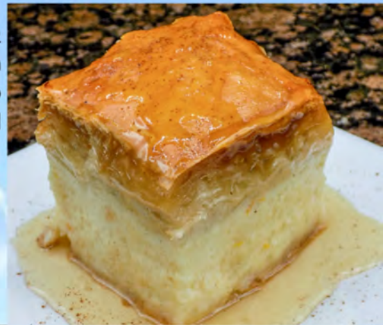
Galaktoboureko Custard in a crispy phyllo pastry shell $5.50