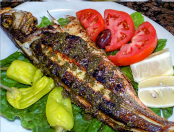
Fresh Whole Branzino Mediterranean Sea Bass imported from Greek islands (upon availability) $29.95