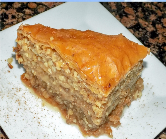
Baklava Nuts & honey baked in phyllo dough $5.50