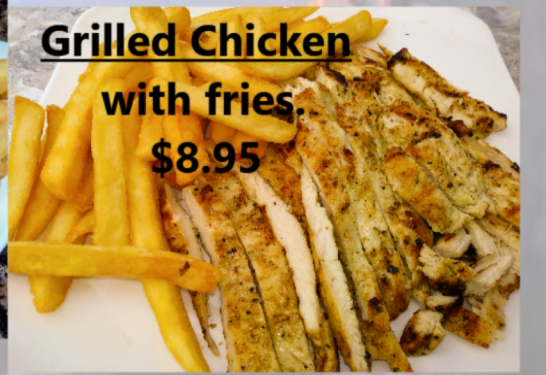
Grilled Chicken with fries. $8.95