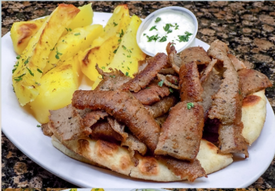
Gyro Plate Sliced beef & lamb mix, over pita bread $17.95