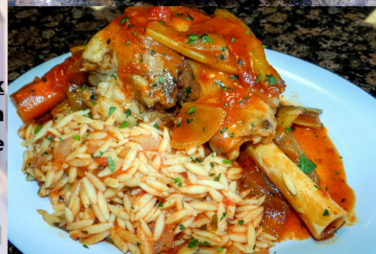
Lamb Shank Cooked with Mediterranean sauce $20.95