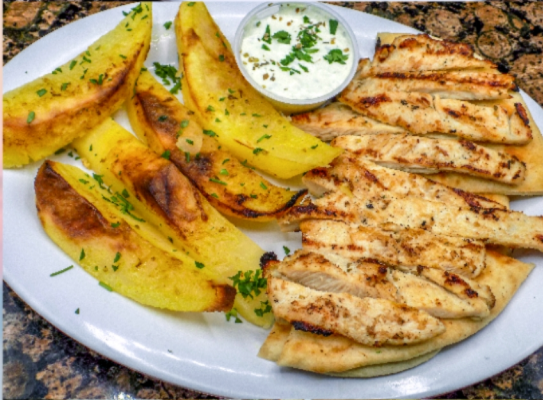
Grilled Chicken Breast Chargrilled marinated chicken breast over pita bread $17.95