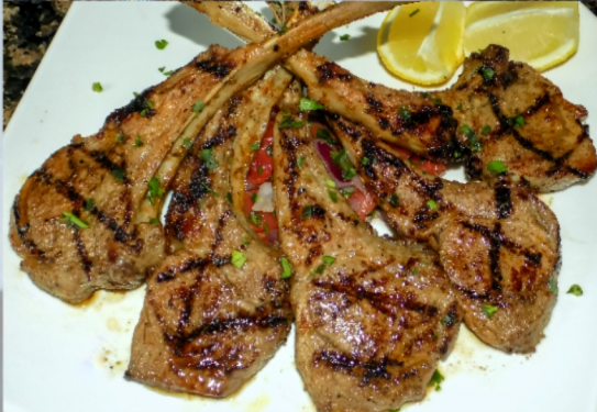
Fresh Baked Branzino Tender fillet Mediterranean Sea Bass imported from Greek islands (upon availability) Lamb Chops Five chargrilled baby lamb chops $29.95