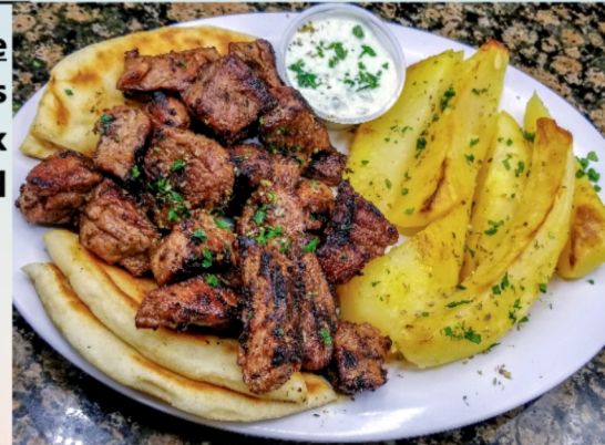
Souvlaki Plate Chargrilled chunks of marinated pork over pita bread $17.95