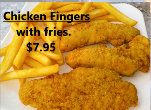
Chicken Fingers with fries. $7.95