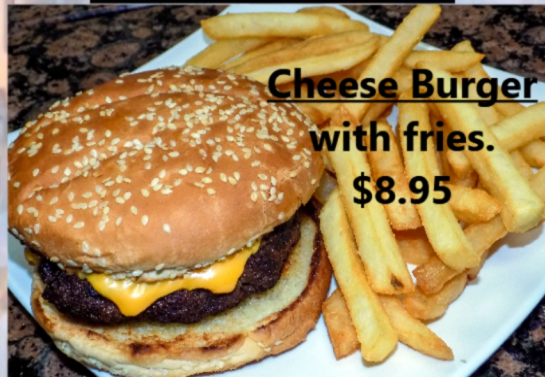
Cheese Burger with fries. $8.95