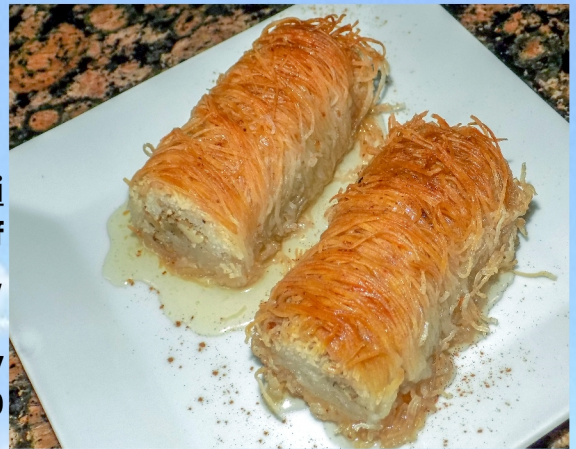
Kataifi Two pieces of shredded phyllo, with nuts & honey $5.50