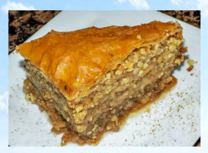
Baklava Nuts & honey baked in phyllo dough $5.95