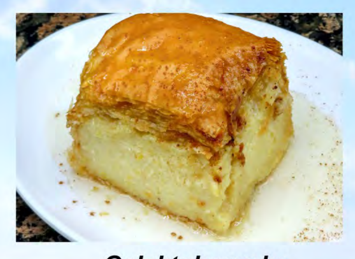
Galaktoboureko Custard in a crispy phyllo pastry shell $5.95