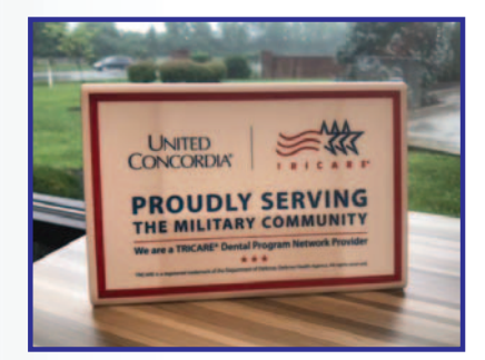
WE SUPPORT THE MILITARY!