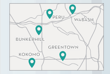
LADD DENTAL GROUP OF BUNKER HILL