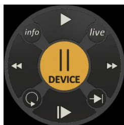
Page 1 – Trick Play

Initial setup is now complete. Swipe the Settings Page to the right to return to Page 1 of the app. If you need to access the settings screen after initial setup, simply go to Page 4 of the app for the settings button. Reference General App Usage.