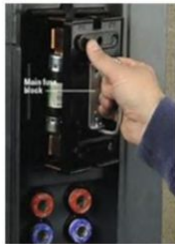
Pull-out Cartridge Fuses