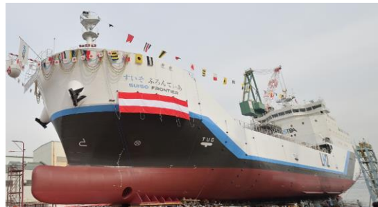
Liquefied Hydrogen Carrier “SUISO FRONTIER”

Length over all : 116.0m Breadth moulded : 19.0m Depth moulded : 10.6m Design Draft : 4.5m Gross Tonnage : abt. 8,000T Tank Capacity : abt. 1,250CBM Speed on design draft: : abt. 13 knot Complement : 25 persons Flag : Japan Builder : Kawasaki Heavy Industries, Ltd.