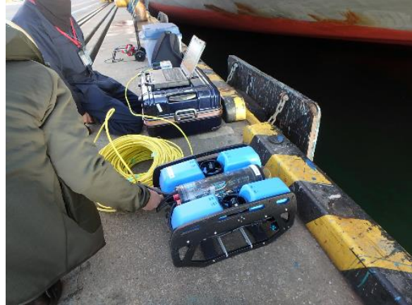
(Right) Underwater Drone (Left) Trial inspection of Aerial Drone in a cargo hold

Please refer to the link below for a closeup video captured by aerial drone.