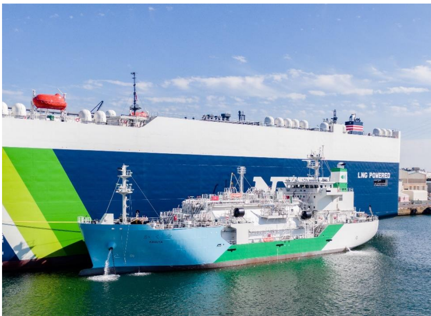
“ Kaguya ” supplying LNG fuel

“K” Line Group sets safety, environment and quality as key management issues and is working towards reducing GHG emissions based on its long-term environmental policy "Environmental Vision 2050" (Note 4). By expanding LNG-fueled vessels with LNG fuel bunkering business, we will contribute to the reduction of environmental burdens.