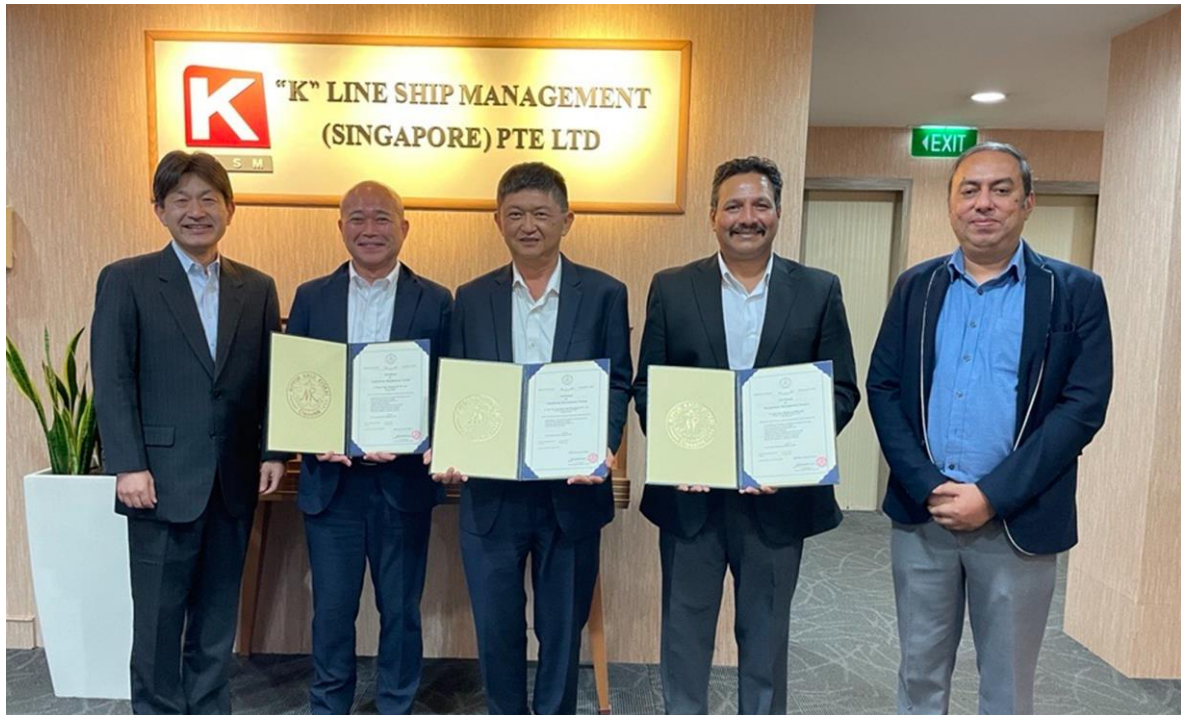
(Group photograph after the first audit)