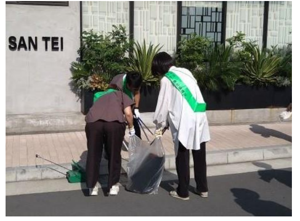
Daito Corporation (Tokyo, Japan)