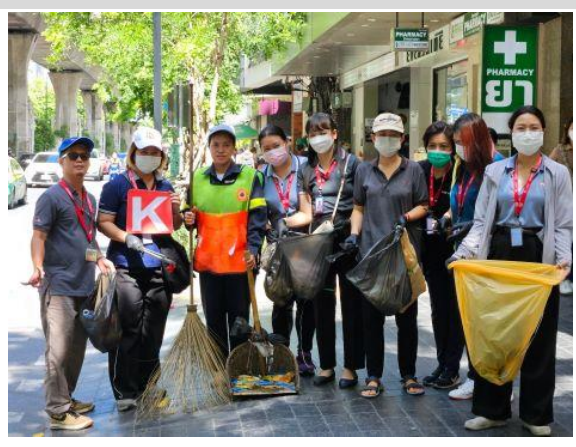
K Line (Thailand) Ltd.