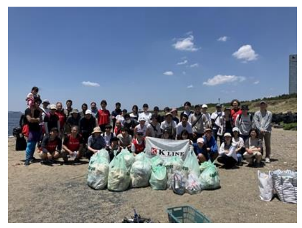
Kawasaki Kisen Kaisha, Ltd. (Tokyo, Japan)