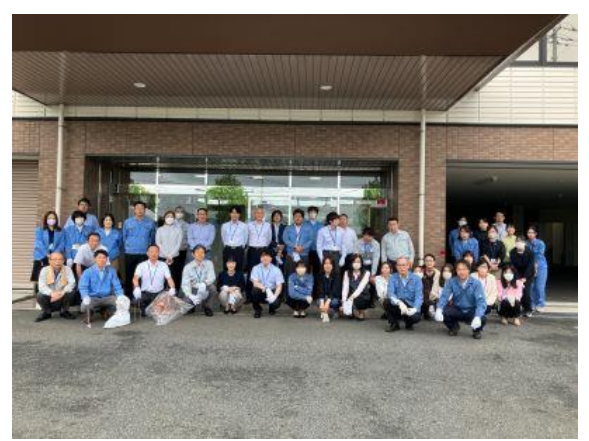
Seagate Corporation (Hiroshima, Japan)