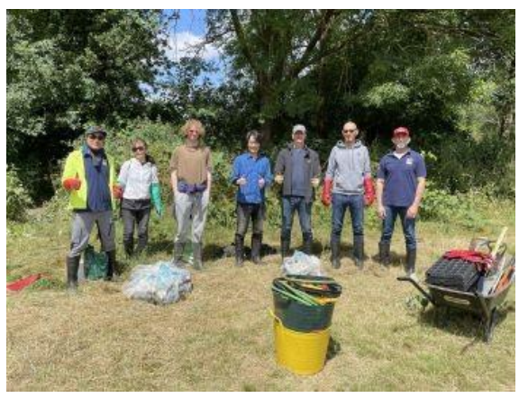
"K" Line (Europe) Limited "K" Line Bulk Shipping (UK) Limited "K" Line LNG Shipping (UK) Limited (UK)