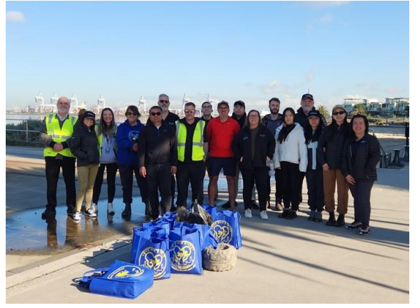
"K" Line (Australia) Pty Limited "K" LINE LOGISTICS (AUSTRALIA) PTY. LTD. (Australia)