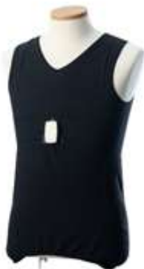
(Wearable IoT solution)