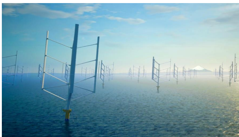
Artist's concept of a floating axis wind turbine (FAWT) wind farm

Electric Power Development Co., Ltd. (J-POWER), 1 Tokyo Electric Power Company Holdings, Inc. (TEPCO HD), 2 Chubu Electric Power Co., Inc. (Chubu Electric), 3 Kawasaki Kisen Kaisha, Ltd. (“K” LINE), 4 and Albatross Technology Inc. (Albatross), 5 have entered into a joint research agreement for a next-generation (floating axis) offshore wind turbine demonstration project (the “project”).