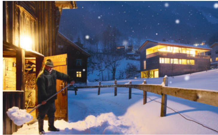
SKIING IN LECH ZÜRS AM ARLBERG, TOBOGGANING FUN IN THE BRANDNERTAL, TRADITIONAL AND MODERN ARCHITECTURE IN THE BREGENZERWALD