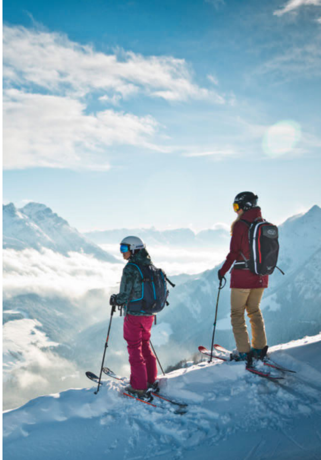
SKIING HOLIDAYS AT THEIR BEST