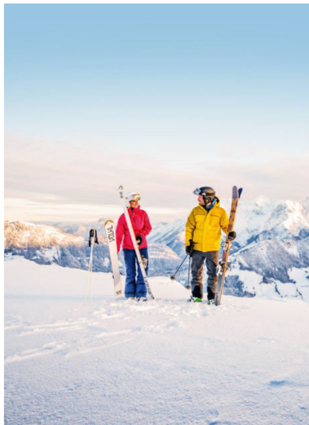
BEAUTIFUL MOUNTAINS IN THE BIGGEST SKI AREAS OF AUSTRIA IN THE KITZBÜHEL ALPS