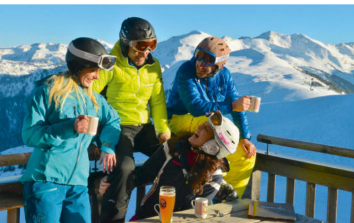
AUTHENTIC CHARM, LOVELY VILLAGES AND VARIED SLOPES