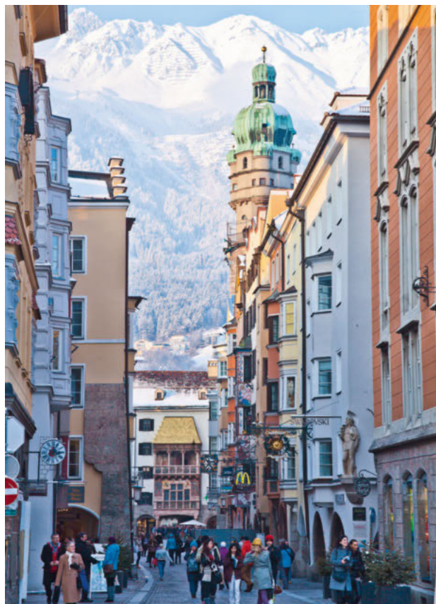
INNSBRUCK OLD TOWN WITH THE NORDKETTE SKI AREA IN THE BACKGROUND

INFORMATION & BOOKING T +43 512 562000 E hotel@innsbruck.info W www.innsbruck.info