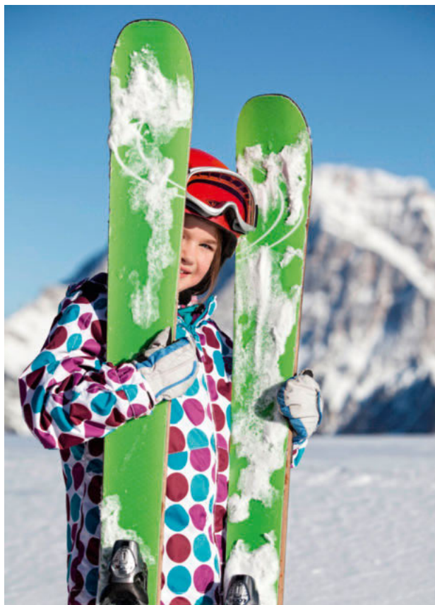
SKI INSTRUCTION FOR CHILDREN