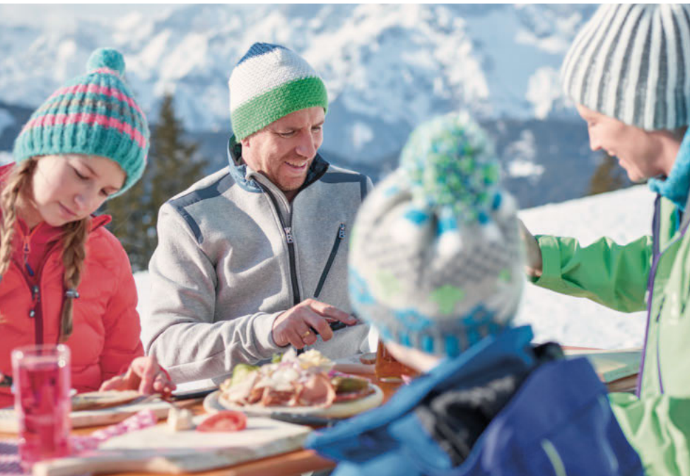
RECHARGING OUR BATTERIES AT A LOG CABIN WITH HEARTY TIROLEAN SPECIALITIES

The feeling of infinite freedom that rushes through you as you plough through the glittering powder snow is indescribable. You simply have to experience it for yourself .