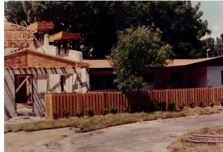
Summer 1989 View from the south. Existing house seen to the right, new building on left.