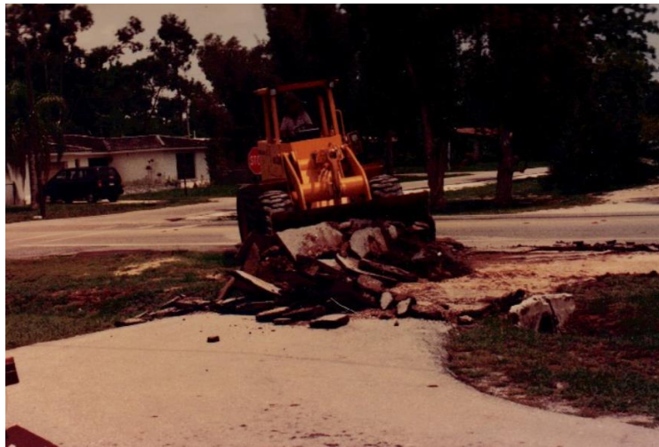
Summer 1989 Driveway under construction