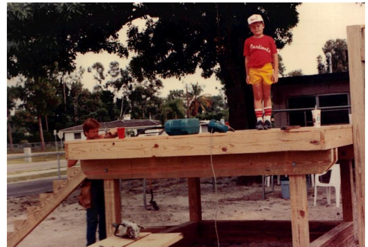
Summer 1989 Playground under construction