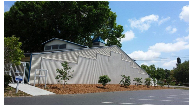
Spring 2015 – Fruit tree orchard