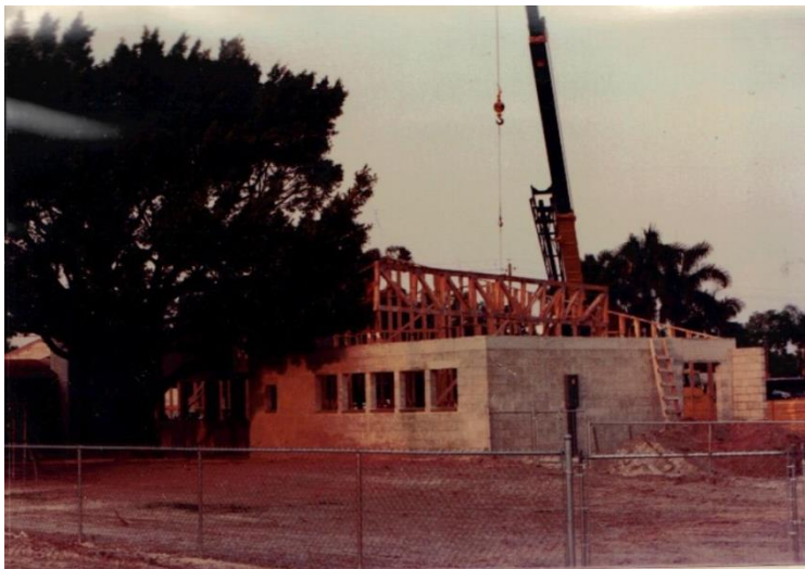
Summer 1989 View from the northeast