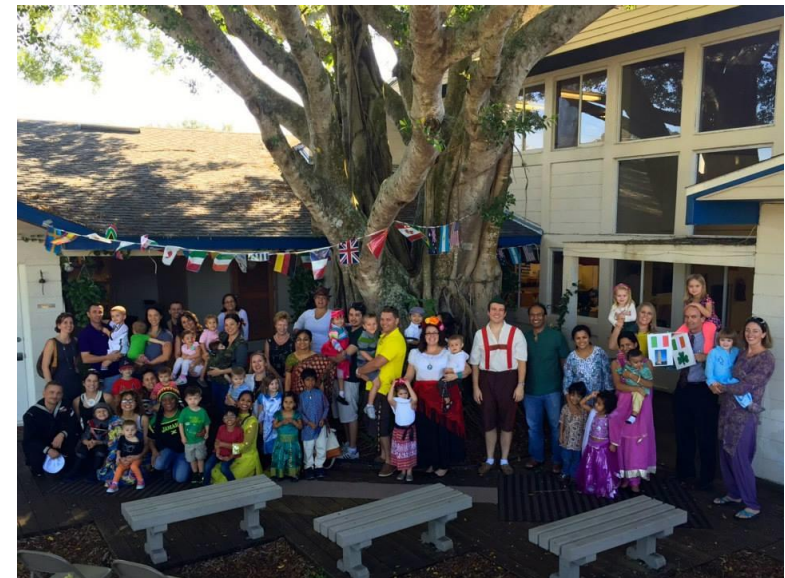
Fall 2014 – Cultural Diversity Celebration