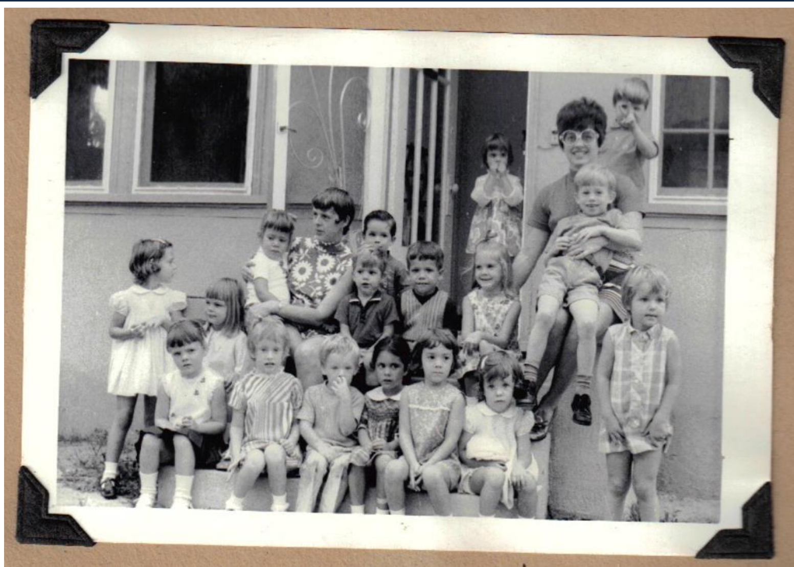
Autumn 1969 – Inaugural class held at the Little Green House location off Colonial Boulevard and Summerlin road in Fort Myers, FL.