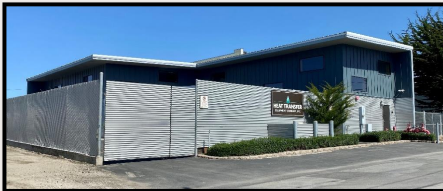
175 HARVARD AVENUE, HALF MOON BAY, CA 94019

Heat Transfer Equipment Company and Htec Packaged Systems & Controls have engineered and manufactured packaged systems for a wide range of Mechanical, Plumbing, & Industrial applications.