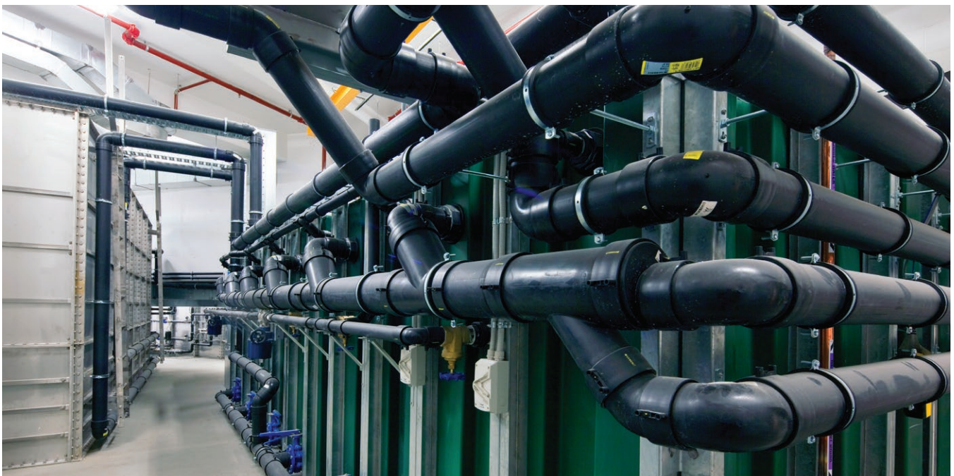
An onsite reuse system