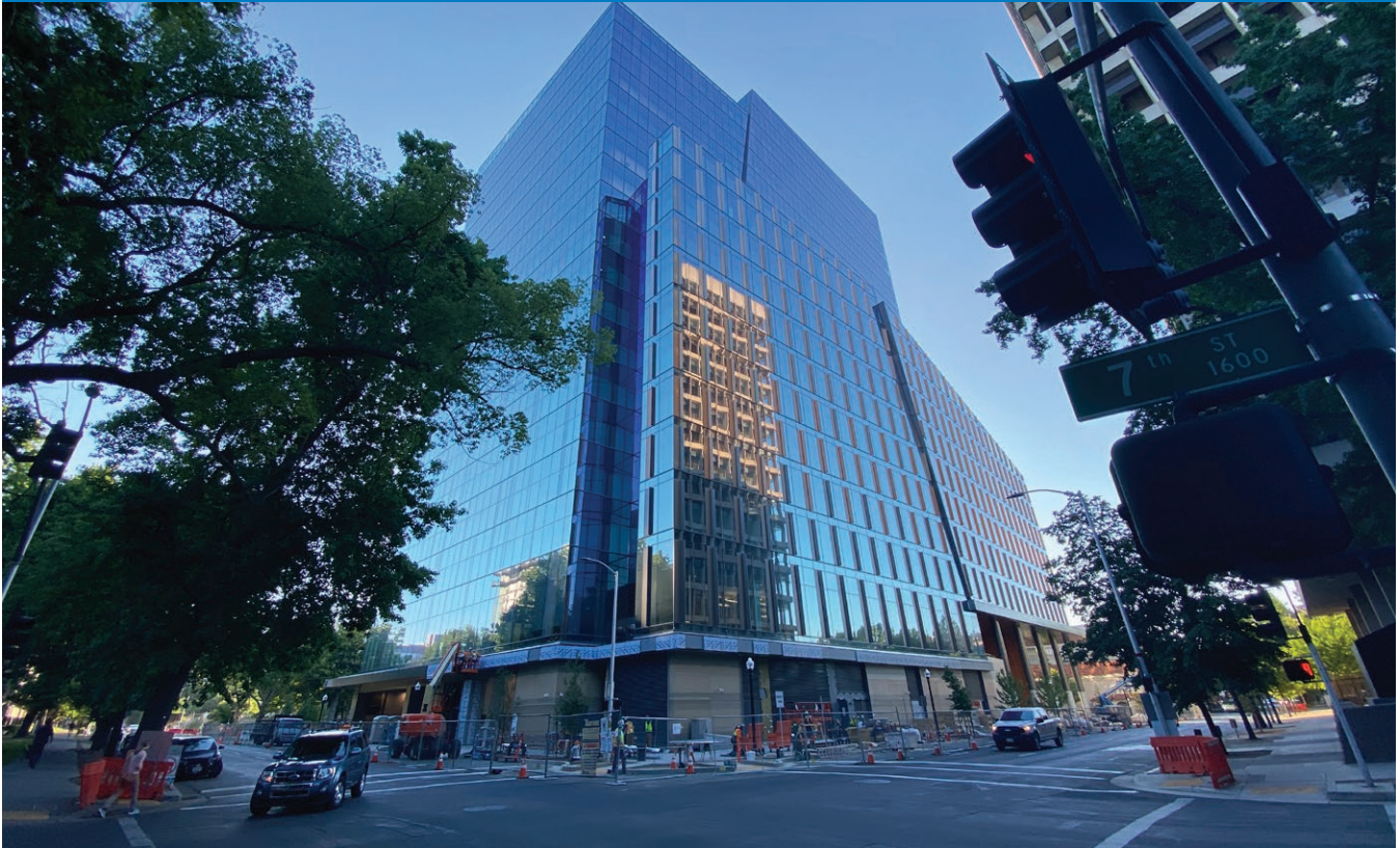
DGS Natural Resources Building under final stage of construction

Project Status: Under Construction (Estimated Completion Late 2021)