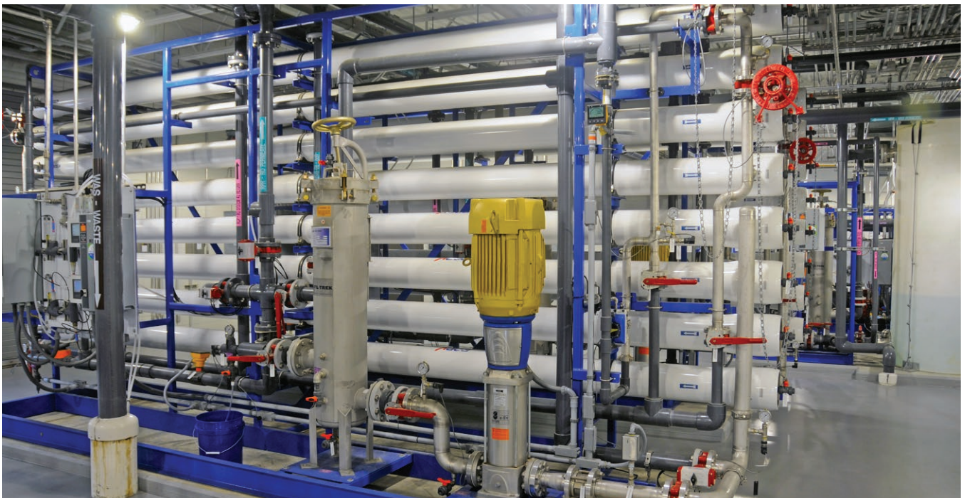
An onsite reuse system's mechanical room