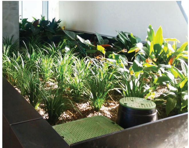
2nd stage of a wetland treatment

This report is intended for developers, architects, and designers of onsite water reuse systems. Numerous people around the world were contacted to share their stories, projects, and lessons learned so that they may share proof of concepts to encourage transformation in the water sector. These projects range from individual buildings recycling wastewater to entire neighborhoods actively engaged in the management of their water. While water reuse remains a central theme within the case studies, each project showcases a unique, innovative approach to using more water efficiently.