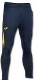
339 DARK NAVY/YELLOW