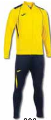
903 YELLOW/ DARK NAVY