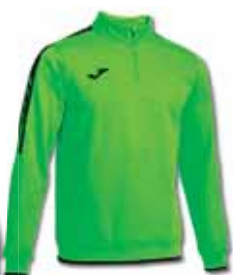
021 GREEN FLUOR/ BLACK