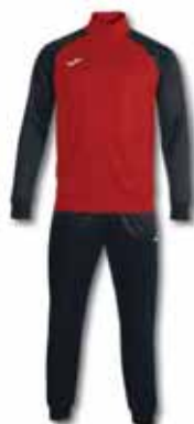
601 RED/ BLACK