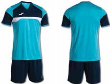
013 TURQUOISE FLUOR/ DARK NAVY