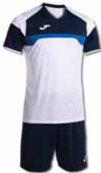
203 WHITE/DARK NAVY