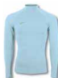
350 SKY BLUE