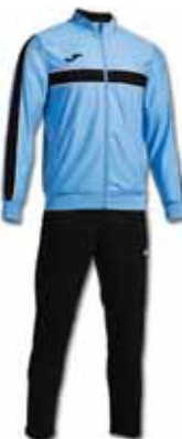
381 SKY BLUE/ BLACK