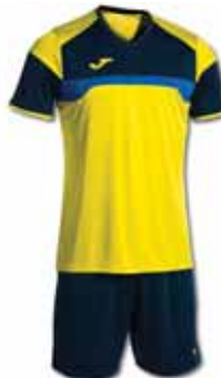
903 YELLOW/ DARK NAVY