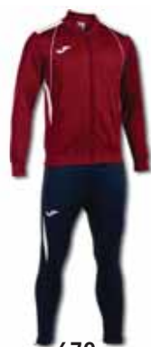
672 BURGUNDY/ WHITE/DARK NAVY