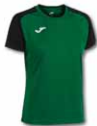
451 GREEN MEDIUM/ BLACK