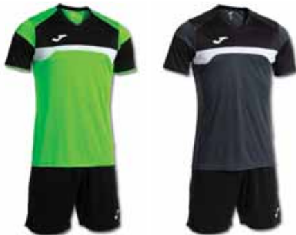
021 FLUOR GREEN/BLACK