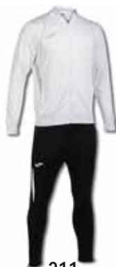
211 WHITE/ BLACK