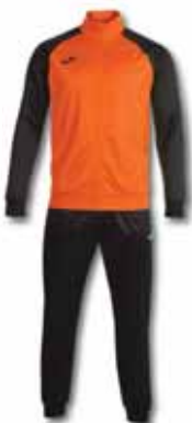
881 ORANGE/ BLACK