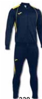
339 DARK NAVY/ YELLOW