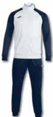
203 WHITE/ DARK NAVY