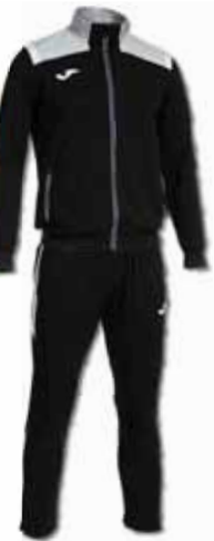
100 BLACK/MEDIUM GREY