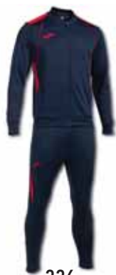
336 DARK NAVY/ RED