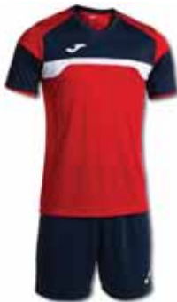
603 RED/DARK NAVY