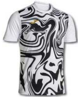
201 WHITE/ BLACK