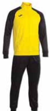
901 YELLOW/ BLACK