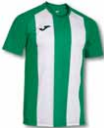
452 GREEN MEDIUM/ WHITE