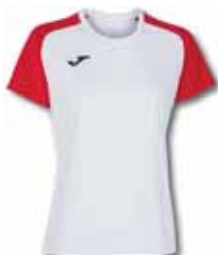
206 WHITE/ RED