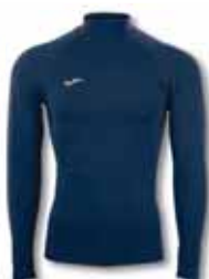
331 DARK NAVY