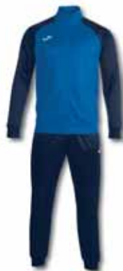
703 ROYAL/ DARK NAVY