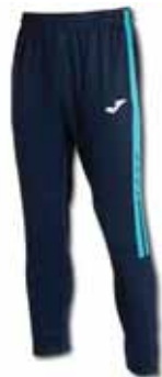
342 DARK NAVY/ TURQUOISE FLUOR