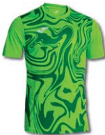
020 GREEN FLUOR