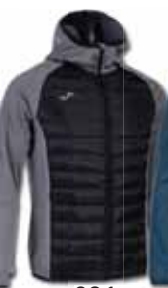
281 BLACK/ MEDIUM GREY