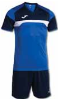
703 ROYAL/DARK NAVY