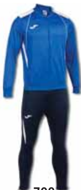
702 ROYAL/WHITE/ DARK NAVY