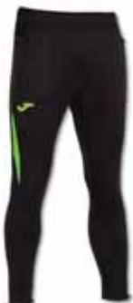
117 BLACK/ GREEN FLUOR