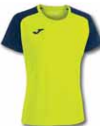
063 YELLOW FLUOR/ DARK NAVY