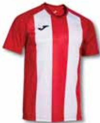
602 RED/ WHITE