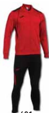
601 RED/ BLACK