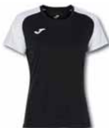
102 BLACK/ WHITE