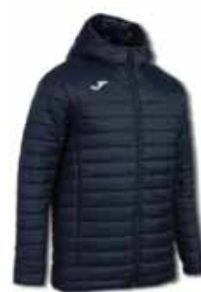
331 DARK NAVY