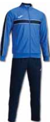
703 ROYAL/ DARK NAVY