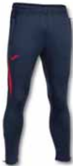
336 DARK NAVY/RED