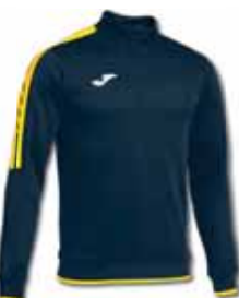
339 DARK NAVY/ YELLOW