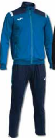
703 ROYAL/DARK NAVY