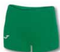
450 GREEN MEDIUM