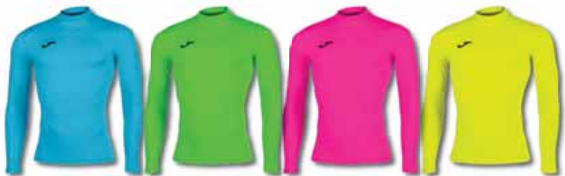
010 TURQUOISE FLUOR 020 GREEN FLUOR 030 PINK FLUOR 060 YELLOW FLUOR