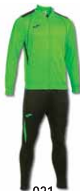
021 GREEN FLUOR/ BLACK