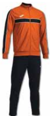
881 ORANGE/ BLACK