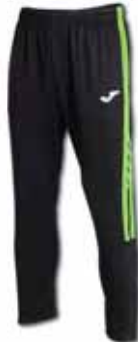
117 BLACK/FLUOR GREEN