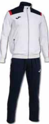
203 WHITE/DARK NAVY