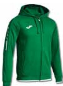
450 GREEN MEDIUM