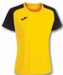
901 YELLOW/ BLACK