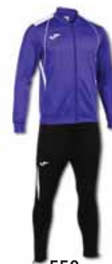
552 VIOLET/WHITE/ BLACK