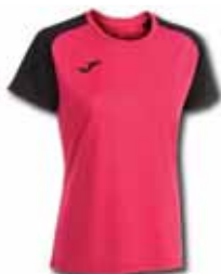
501 RASPBERRY/ BLACK