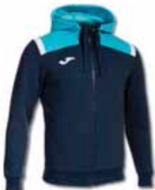
342 DARK NAVY/ TURQUOISE FLUOR