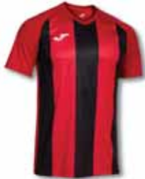
601 RED/ BLACK