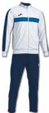
203 WHITE/ DARK NAVY