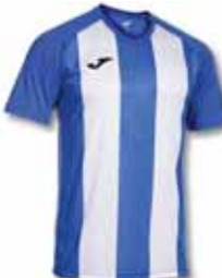
702 ROYAL/ WHITE