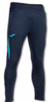
342 DARK NAVY/ TURQUOISE FLUOR