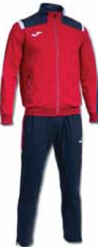
603 RED/DARK NAVY