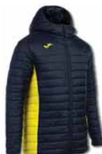
339 DARK NAVY/ YELLOW