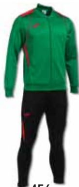
456 GREEN/RED/ BLACK