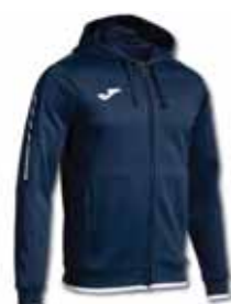
331 DARK NAVY