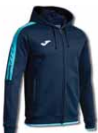
342 DARK NAVY/ TURQUOISE FLUOR