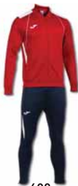
602 RED/WHITE/ DARK NAVY