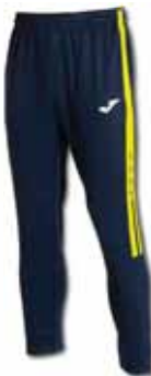
339 DARK NAVY/ YELLOW