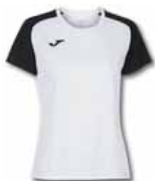
201 WHITE/ BLACK