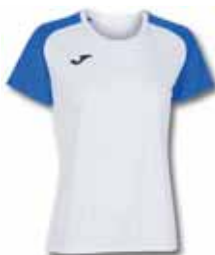
207 WHITE/ ROYAL