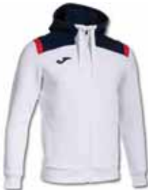
203 WHITE/ DARK NAVY