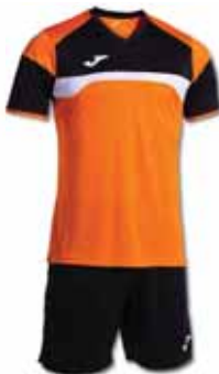
881 ORANGE/ BLACK