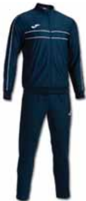
332 DARK NAVY