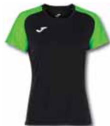
117 BLACK/ GREEN FLUOR