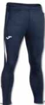
332 DARK NAVY/WHITE