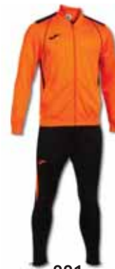
881 ORANGE/ BLACK