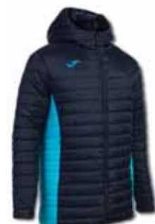
342 DARK NAVY/ TURQUOISE FLUOR