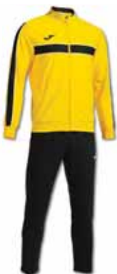
901 YELLOW/ BLACK