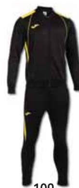
109 BLACK/ YELLOW