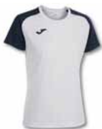
203 WHITE/ DARK NAVY