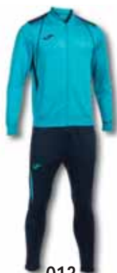
013 TURQUOISE FLUOR/ DARK NAVY