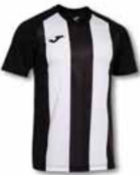
102 WHITE/ BLACK