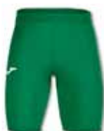
450 GREEN MEDIUM