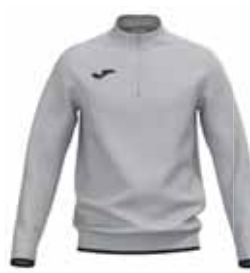
251 MELANGE MEDIUM