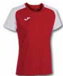
602 RED/ WHITE