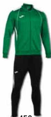
452 GREEN/WHITE/ BLACK