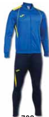
709 ROYAL/YELLOW/ DARK NAVY