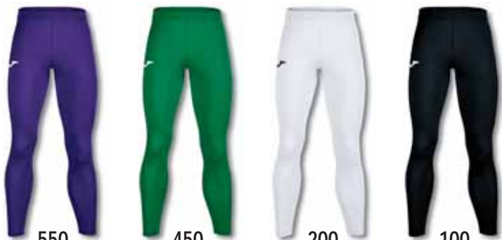
550 VIOLET 450 GREEN MEDIUM 200 WHITE 100 BLACK