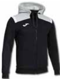
100 BLACK/ MEDIUM GREY