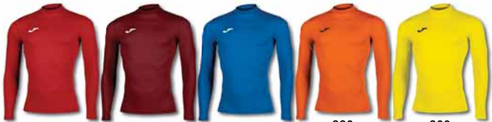
600 RED 671 BURGUNDY 700 ROYAL 880 ORANGE 900 YELLOW