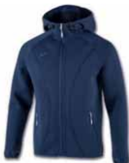
331 DARK NAVY

Softshell open jacket with zipper including inner elasticated drawstring hood for a better fit, two pockets with zipper on the front and embroidered logo.