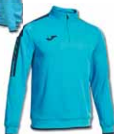
013 TURQUOISE FLUOR/ DARK NAVY