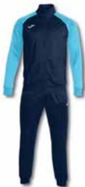
342 DARK NAVY/ TURQUOISE FLUOR