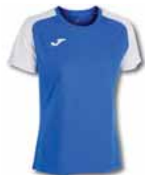
702 ROYAL/ WHITE