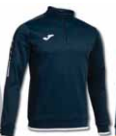
331 DARK NAVY