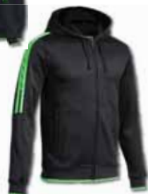
117 BLACK/FLUOR GREEN