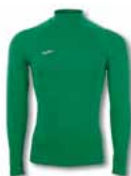
450 GREEN MEDIUM