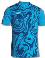
383 MEDIUM SKY/ DARK NAVY