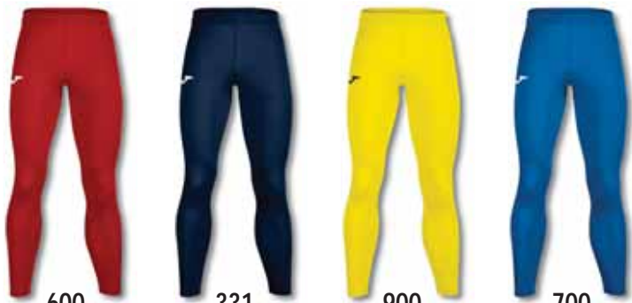
600 RED 331 DARK NAVY 900 YELLOW 700 ROYAL