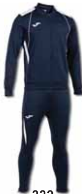
332 DARK NAVY/ WHITE