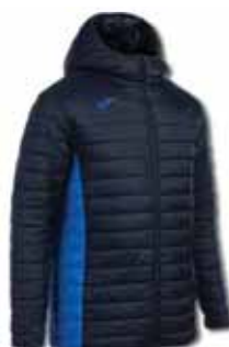
337 DARK NAVY/ ROYAL