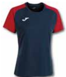
336 DARK NAVY/ RED