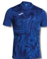
700 DARK ROYAL