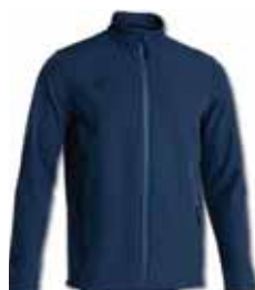
331 DARK NAVY