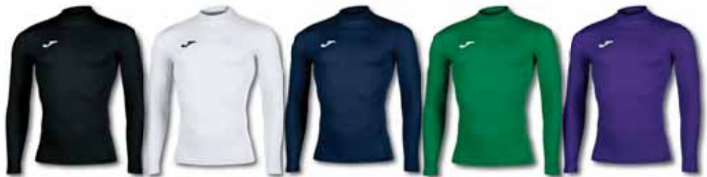
100 BLACK 200 WHITE 331 DARK NAVY 450 GREEN MEDIUM 550 VIOLET