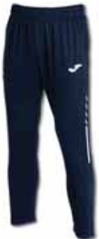
331 DARK NAVY