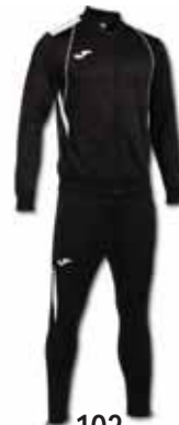
102 BLACK/ WHITE