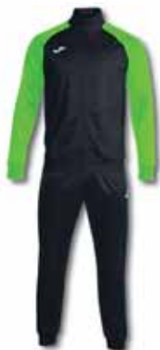
117 BLACK/ GREEN FLUOR