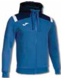
703 ROYAL/ DARK NAVY