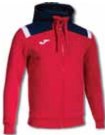
603 RED/ DARK NAVY