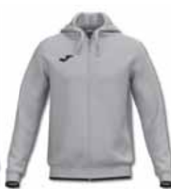
251 MELANGE MEDIUM