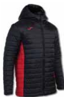
106 BLACK/ RED