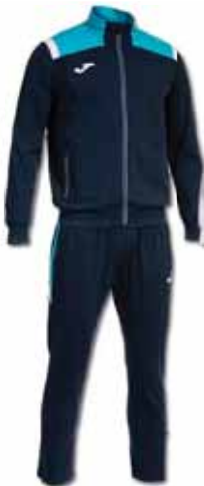
342 DARK NAVY/ TURQUOISE FLUOR