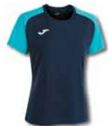
342 DARK NAVY/ TURQUOISE FLUOR