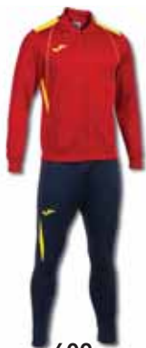
609 RED/YELLOW/ DARK NAVY