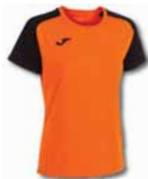
881 ORANGE/ BLACK