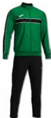
451 GREEN MEDIUM/ BLACK