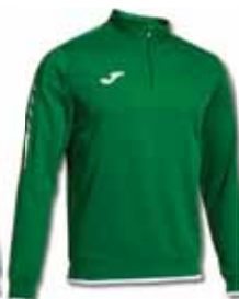
450 GREEN MEDIUM