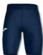
331 DARK NAVY