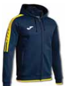
339 DARK NAVY/ YELLOW