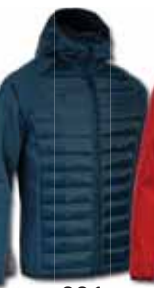
331 DARK NAVY