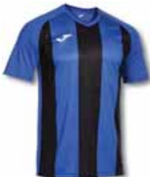
701 ROYAL/ BLACK