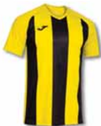
901 YELLOW/ BLACK