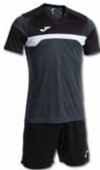
151 ANTHRACITE/ BLACK