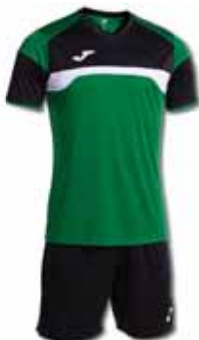
451 GREEN MEDIUM/BLACK