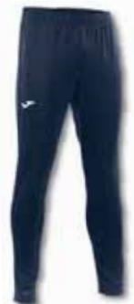
331 DARK NAVY

Long skinny pants. Adjustable elastic drawstring waist.