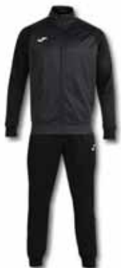
151 ANTHRACITE/ BLACK