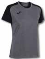
251 LIGHT MELANGE/ BLACK