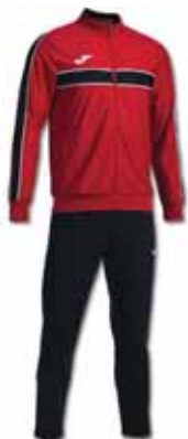
601 RED/ BLACK