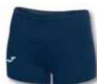
331 DARK NAVY