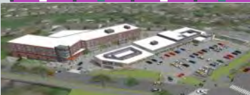
Proposed Shops at Penn Hill by Jair Lynch Real Estate Partners.