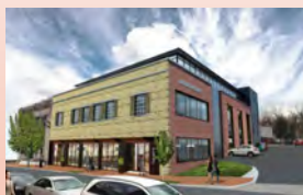
Rendering of planned Busboys and Poets in Anacostia

If you receive a call like this, ask for the company name or phone number, then end the call and contact OPC immediately at (202) 727-3071. Share the information about your call with an OPC consumer outreach specialist who will follow up with the company that contacted you. Read More.