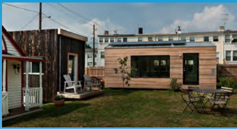
Minim House Picture from Tinyhouseblog.com