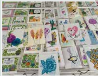
The Angels have been busy!

One last thought. Next month is October. In October we will be having nominations for the open Board positions. All but one position is open, so if you want to help co-ordinate some of our events and activities, now is your chance. I will not be returning as President but will continue to be involved in the Park's activities in some manner. Being on the Board is, well, rewarding. I couldn't really call it "fun", but we do have a bunch of fun putting events on. On the upside, you generally have the inside scoop on what is going on in the park. And even better, you can have a say in what activities and events are being offered. So step up and be involved. If not you, then get your neighbor to run. Tell your neighbor you'll help them. Hey, this is an election. It is politics. Lie if you have to, just get a name on the ballot!