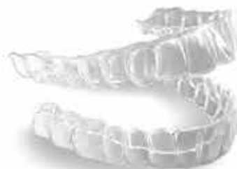
Invisible orthodontic treatment