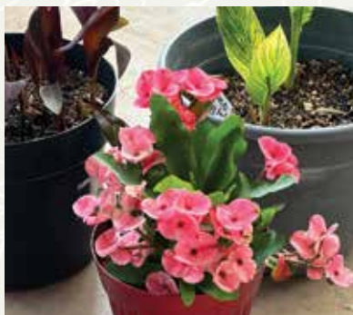
Tropicana Gold, Red Velvet, and Crown of thorns