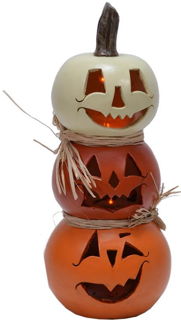
Recalled Mark Feldstein & Associates LED Stacked Gourd Jack O Lantern decoration