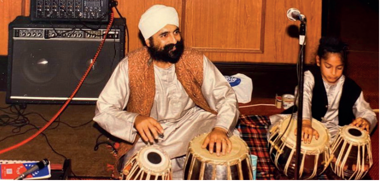
"The bond of friendship is stronger in Freemasonry than anywhere else I've ever experienced. I have a wider, more diverse circle of friends than I ever thought possible."