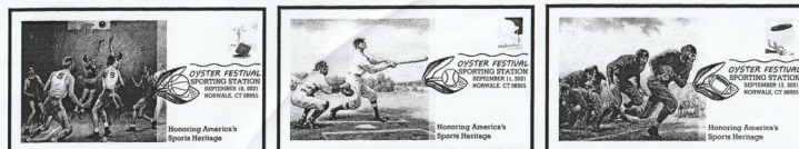
2021 NORWALK OYSTER FESTIVAL COVERS