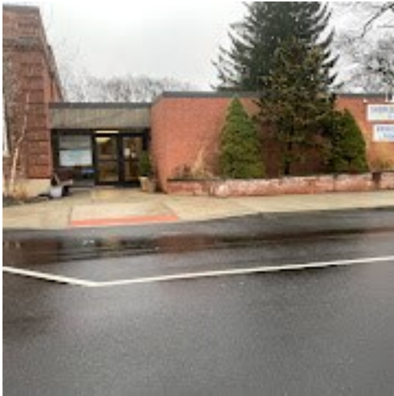
Norwalk Senior Center 11 Allen Road